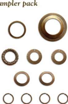
RSP10 Decorative Rings ($15.00)