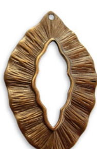
P182 Leaf Pendant 16pcs ($24.00)