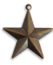
DP191 Starburst 36 pcs ($18.00)