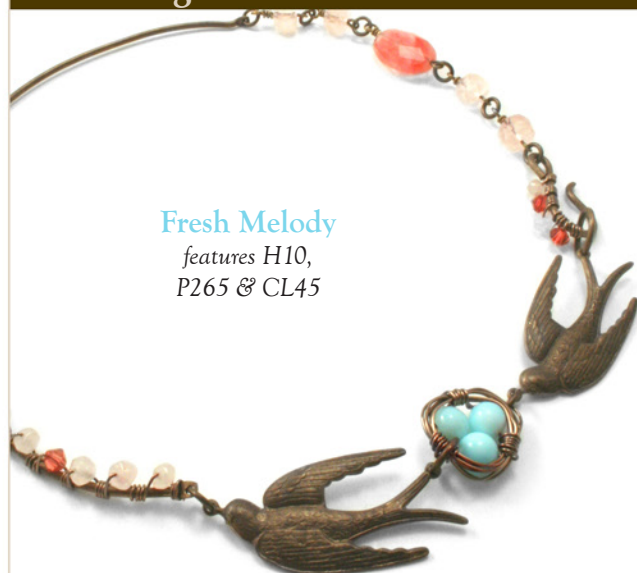
Fresh Melody features H10, P265 & CL45

FREE Step-by Step Project Ideas We design creatively with Vintaj natural brass.