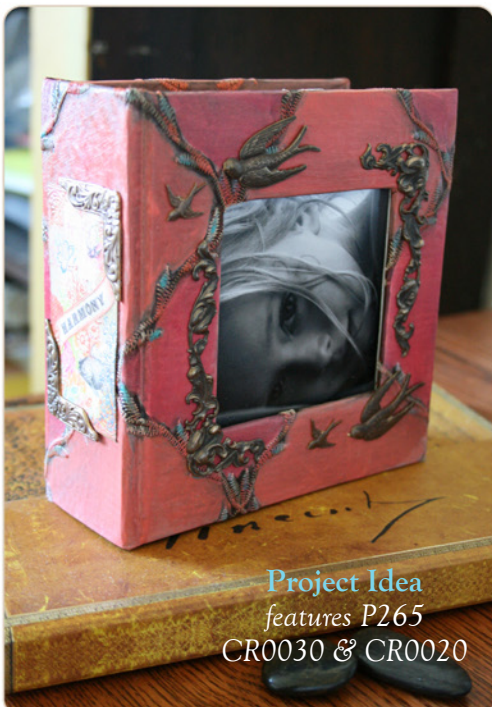
Project Idea features P265 CR0030 & CR0020