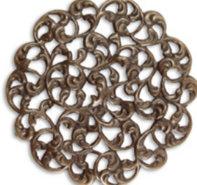
F024 Round Layering Filigree