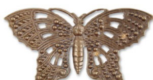
P021 Butterfly Element